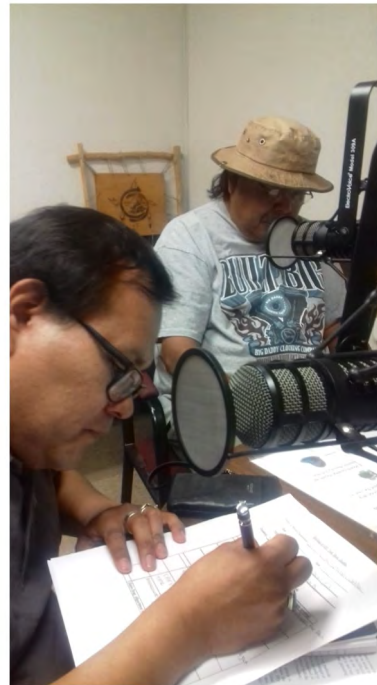
EPO staff at their biweekly radio show at KNNB. "Environmental Hour" is every other Mondays at 9:00am to 10:00 am. Listen in and learn more about our program and the upcoming events.